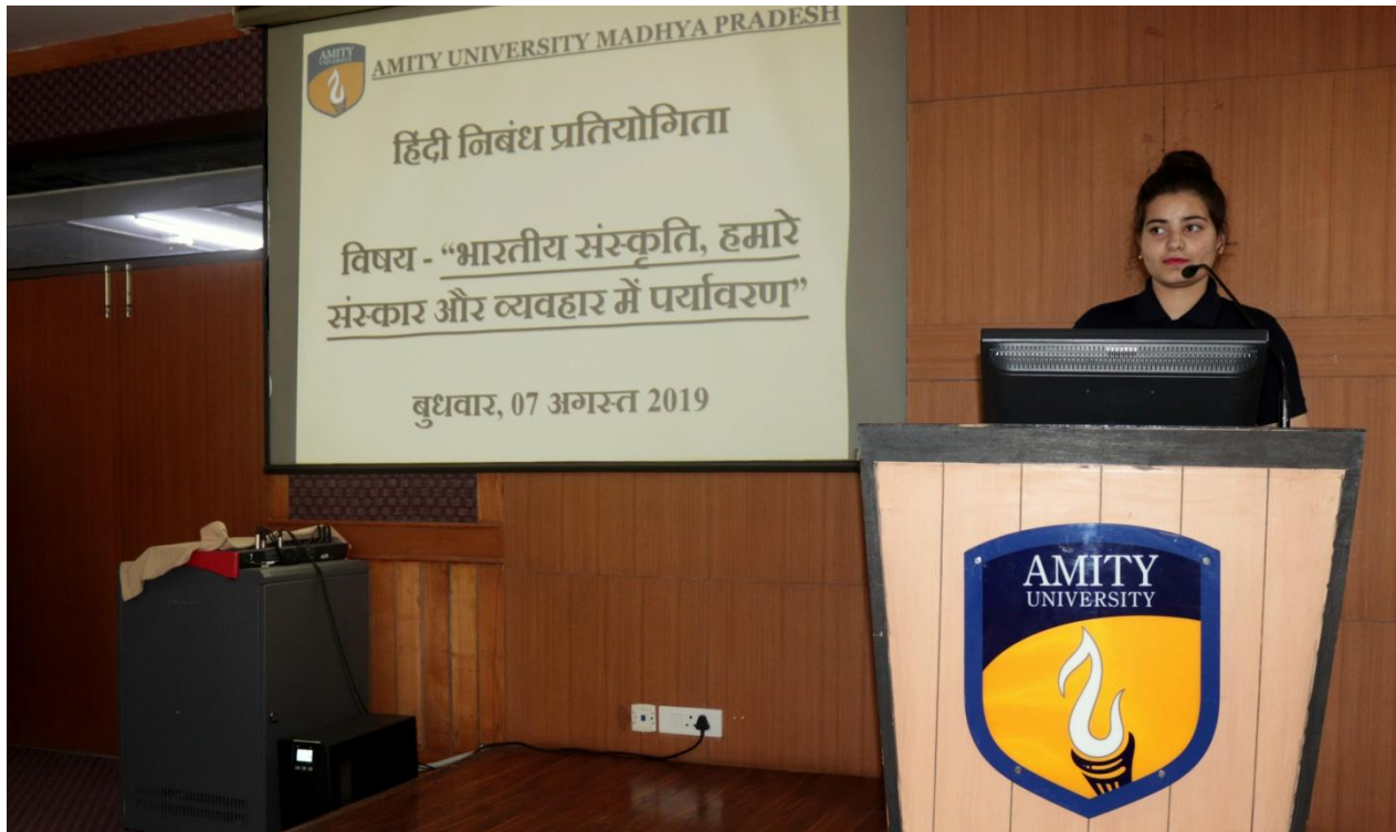
Student coordinator introducing the topic and rules of the competition

Established vide Government of Madhya Pradesh Act No. 27 of 2010