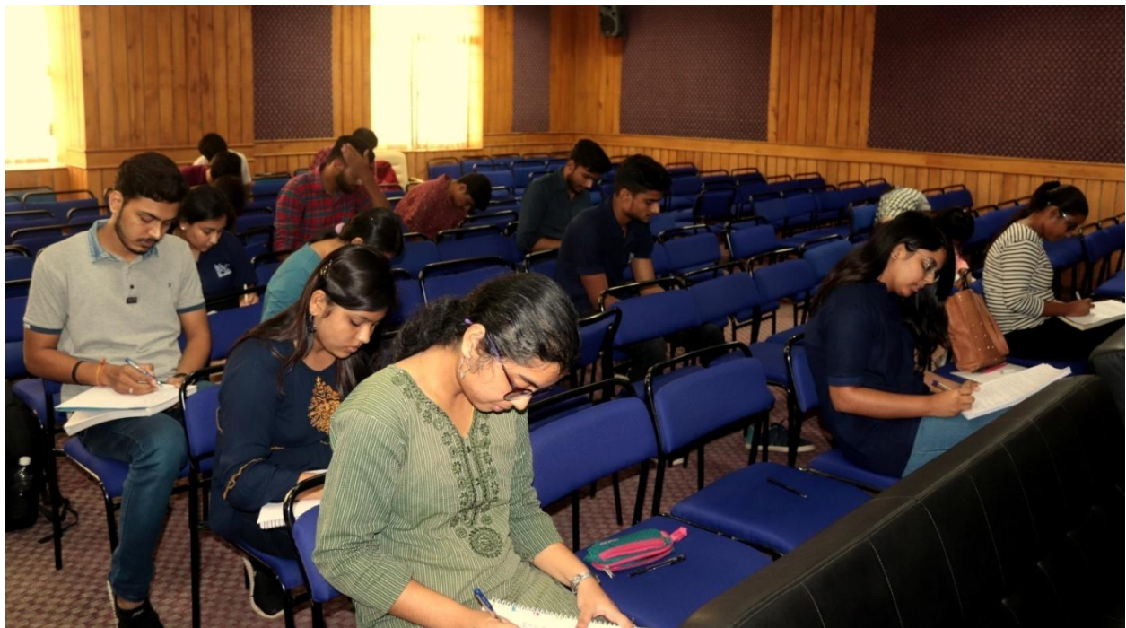
Students planning their essays while the attendance process goes on

Registrar Amity University Madhya Pradesh Gwalior